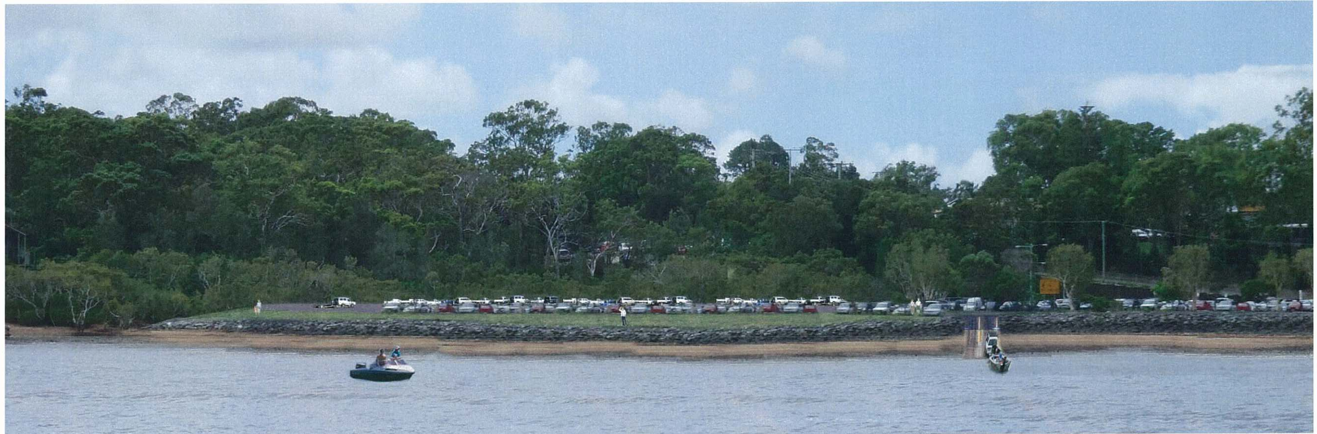
Ferry View - Mean High Water Spring Option