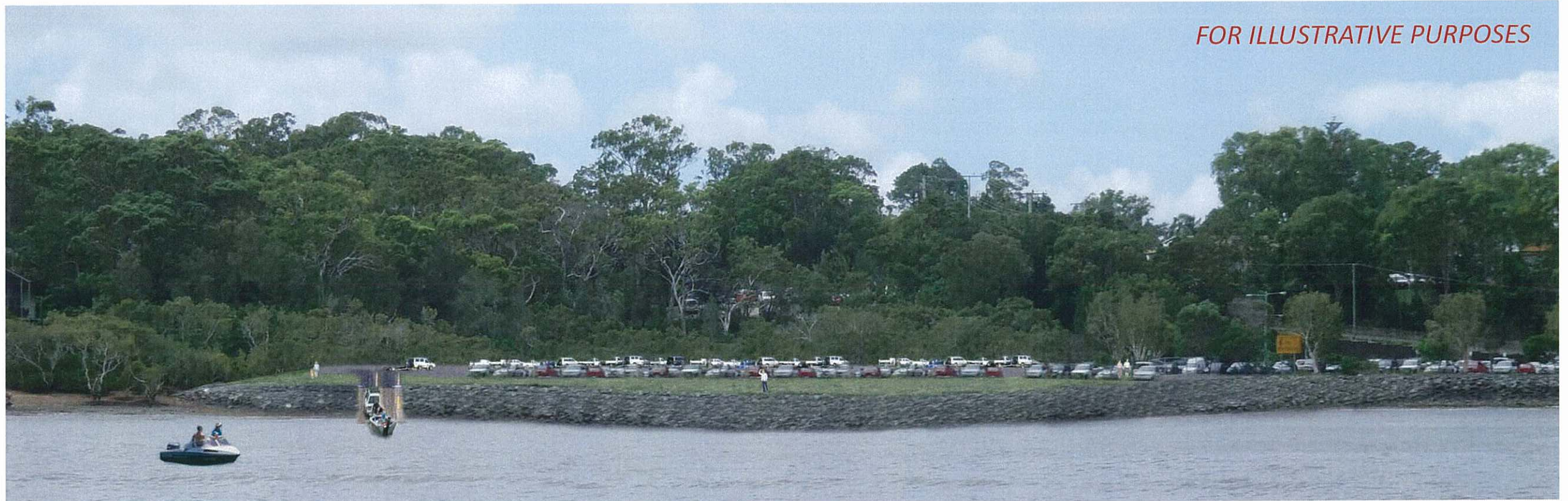
Ferry View - Lowest Astronomical Tide Option