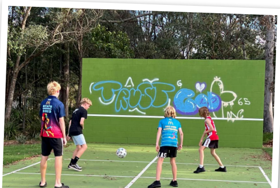
The new tennis wall and ball games stage has well and truly been broken in and is regularly enjoyed in Mount Cotton Park.