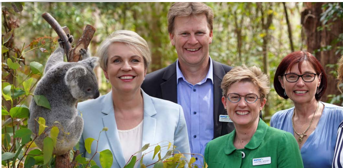
Council is supporting RSPCA Queensland to deliver a purpose-built Wildlife Hospital and Wildlife Centre of Excellence through the provision of a hectare of public land in the Redlands IndigiScapes Centre precinct. RSPCA Queensland and Council have partnered to accelerate the vision for the state-of-the-art facility. Also this year, Council confirmed at its May general meeting its continued support of the Redland Whitewater Centre at Birkdale Community Precinct by committing to being a Brisbane 2032 Olympic and Paralympic Games Junior Games Partner.