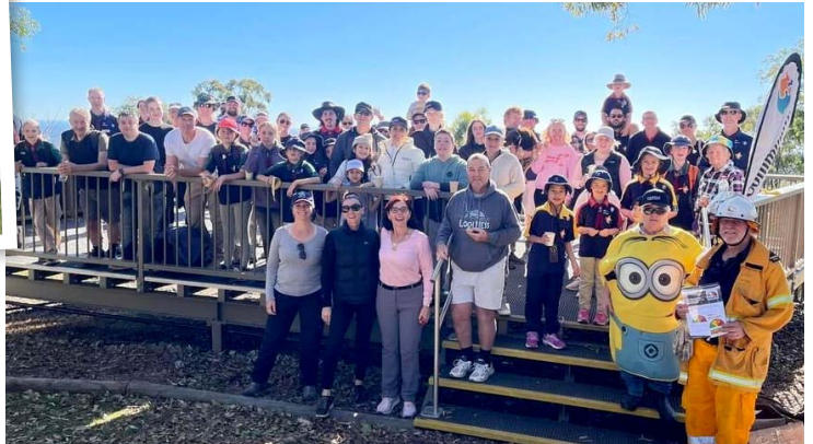
Hike to the Summit 2024, Eastern Escarpment Trail Park, with Mount Cotton Scouts, Community Connections, Mount Cotton Rural Fire Brigade, Supa IGA, Park Social, Strudwick's Property Management and Mount Cotton's Minion.