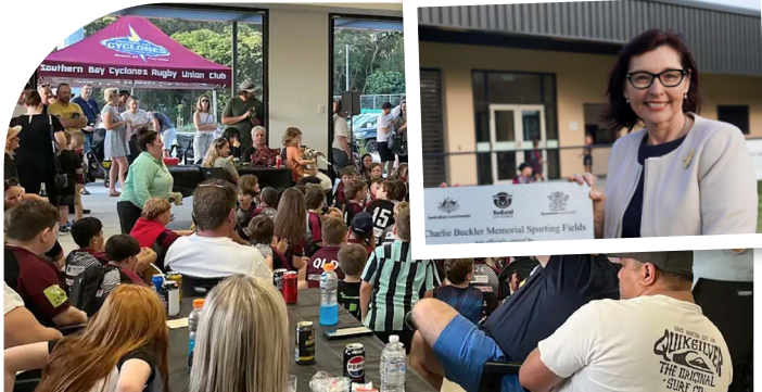
Works wrapped up recently on a major upgrade to the popular Charlie Buckler Memorial Sporting Fields in Redland Bay with an official opening (pictured inset) in September. The new club house was used for the first time by the Redland Bay Cyclones Rugby Union Club for their end of season awards celebration (pictured).