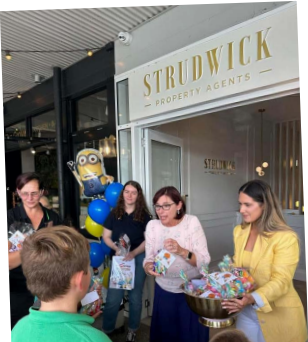
Community Easter Celebrations and Mount Cotton Colouring competition presentations 2024.