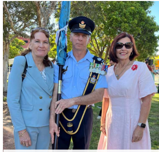
The 95 Wing RAAF exercised their Freedom of Entry to the City of Redland on April 13. It was a sight to see and included a stunning low fly over by a C17 Globemaster.