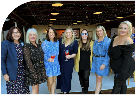
The amazing crew of the Cage Youth Foundation making a difference in the lives of Redlanders both young and not so young.