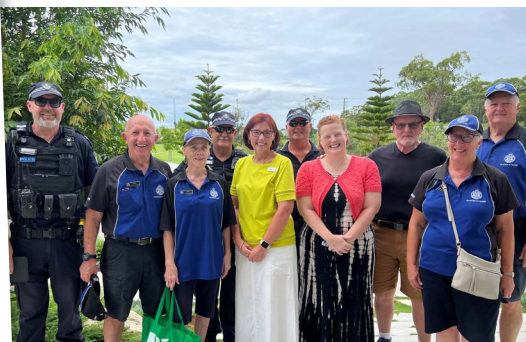
Volunteer Community Policing and Neighbourhood Watch groups made a huge difference to the safety of our city throughout 2024.