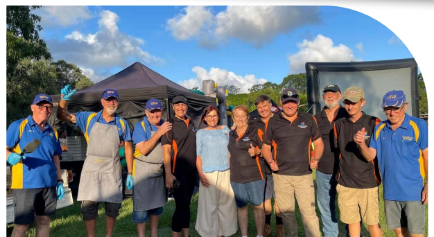
Volunteer community groups are the glue that binds a community. Working together to provide free Movie in the Park events are Redland Bay Men's Shed and Community Connections.