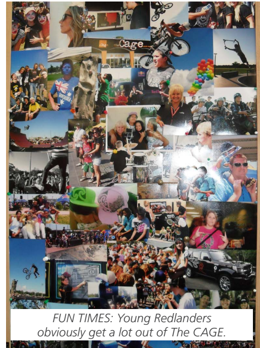
FUN TIMES: Young Redlanders obviously get a lot out of The CAGE.

As a self-funded charity, all donations over $2 are tax deductible. If you would like to partner with The Cage and make a donation, you will be helping it to help others in the City. For more information, go to www.thecage.info